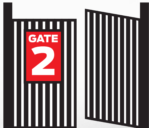
KNOW YOUR GATE NUMBER