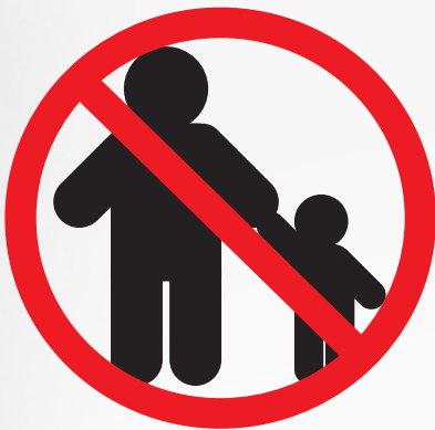
CHILDREN UNDER 15 NOT PERMITTED