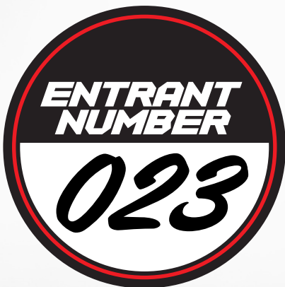
KNOW YOUR ENTRANT NUMBER