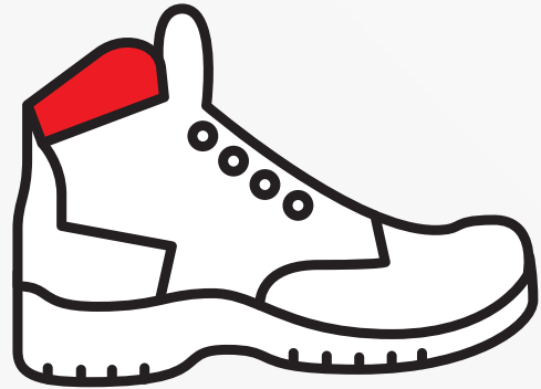
CLOSED TOE SHOES